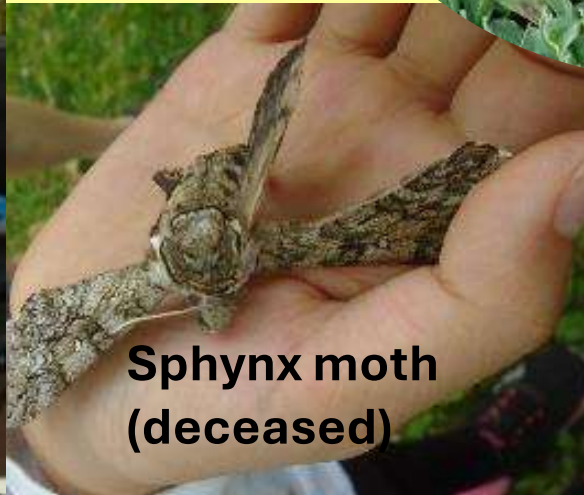
Sphynx moth (deceased)

American lady caterpillar on its host plant, field pussytoes ( Antennaria neglecta )